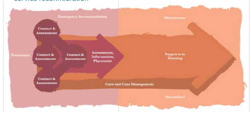
Figure 4 Pathway to Home model of service provision: blueprint for service reconfiguration

Figure 4 below provides a schema that illustrates the model of provision.