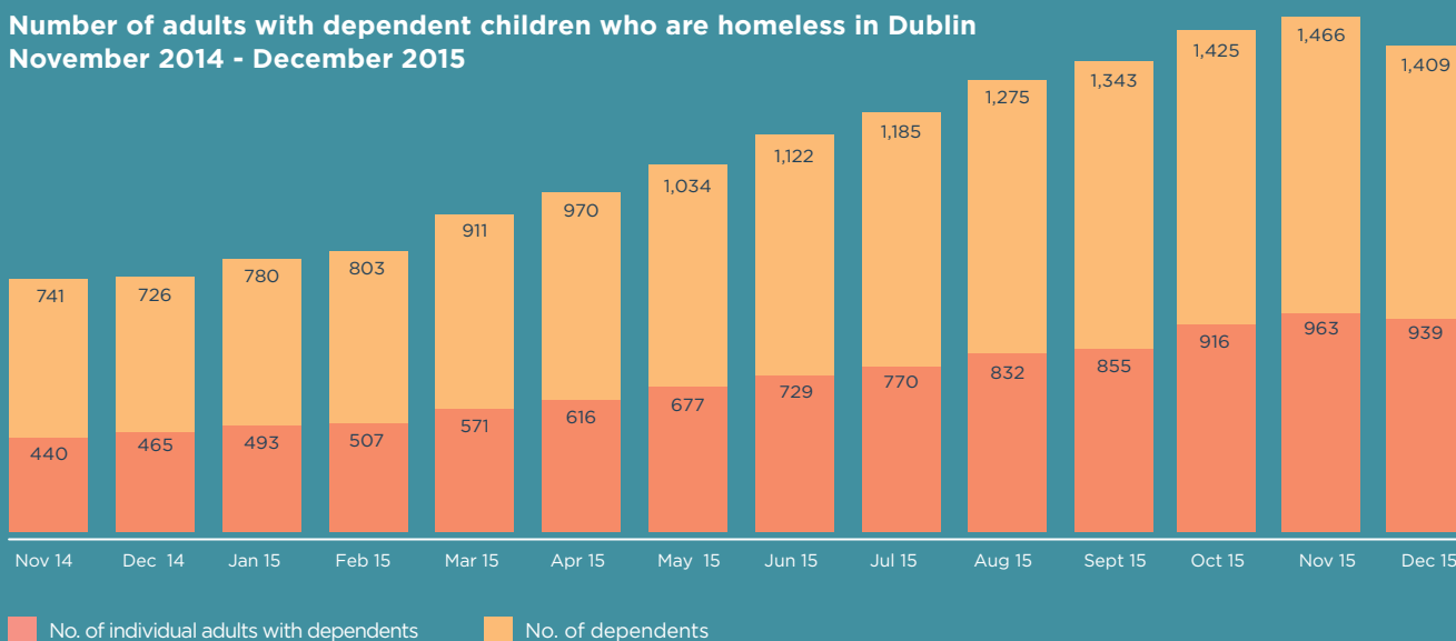
Number of adults with dependent children who are homeless in Dublin November 2014 - December 2015

The Dublin Region Homeless Executive is provided by Dublin City Council as the lead statutory local authority in the response to homelessness in Dublin and adopts a shared service approach across South Dublin County Council, Fingal County Council and Dún Laoghaire-Rathdown County Council.