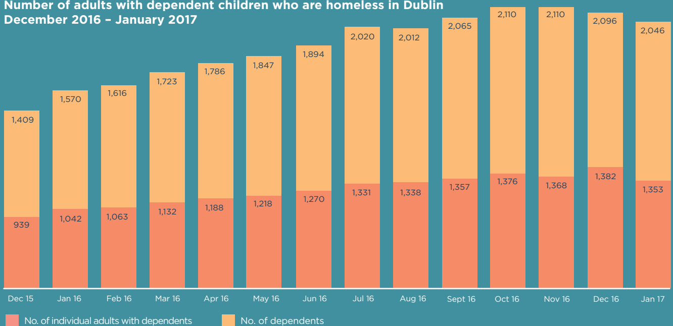
Number of adults with dependent children who are homeless in Dublin December 2016 - January 2017

The Dublin Region Homeless Executive is provided by Dublin City Council as the lead statutory local authority in the response to homelessness in Dublin and adopts a shared service approach across South Dublin County Council, Fingal County Council and Dún Laoghaire-Rathdown County Council.