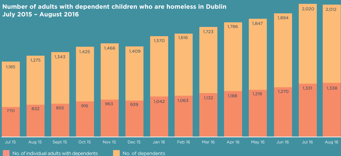
Number of adults with dependent children who are homeless in Dublin July 2015 – August 2016

The Dublin Region Homeless Executive is provided by Dublin City Council as the lead statutory local authority in the response to homelessness in Dublin and adopts a shared service approach across South Dublin County Council, Fingal County Council and Dún Laoghaire-Rathdown County Council.